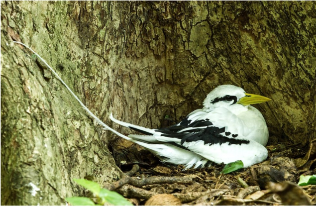
White-tailed Tropicbird, photo: Tubenoses Project © H. Shirihai