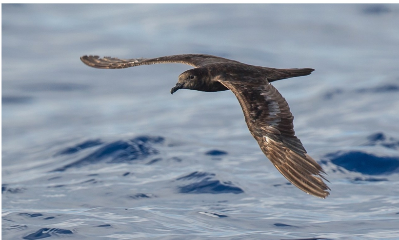
The possible undescribed Bulweria Petrel, photo: Tubenoses Project © H. Shirihi