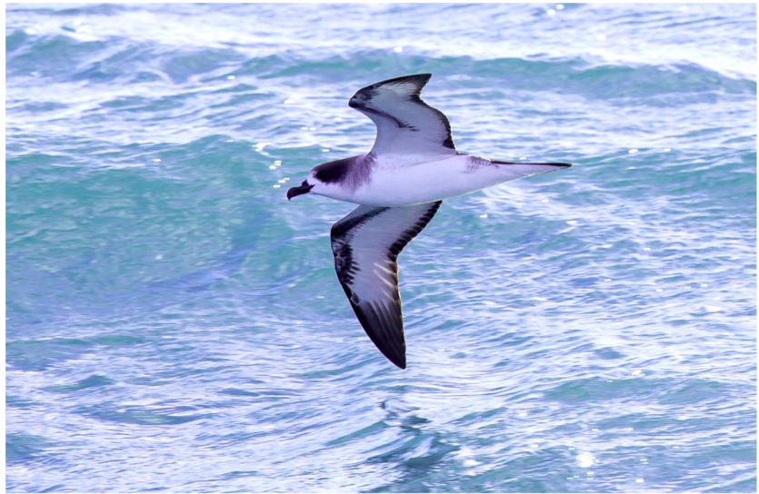
The Barau's Petrel