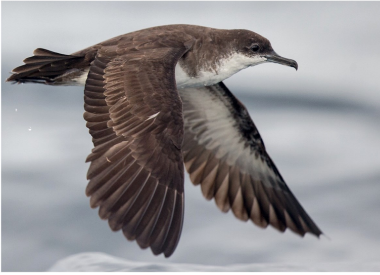
The Seychelles (Tropical) Shearwater